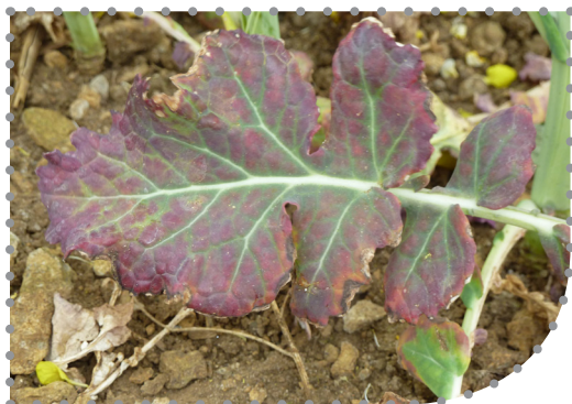
Aspire benefits from TuYV resistance, offering added security on-farm.