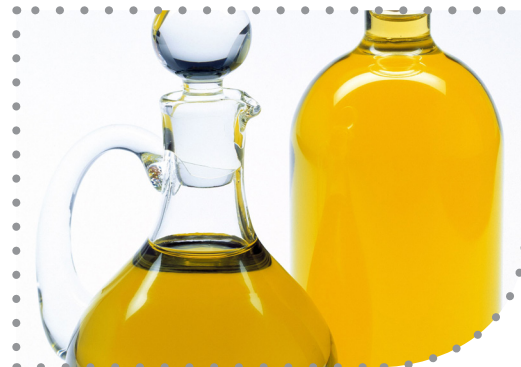
Aspire produces very high oil levels.