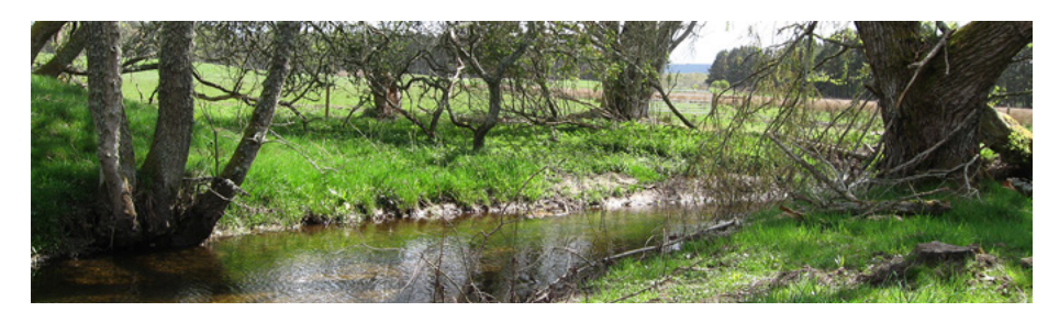
The restored reach* of the Logie Burn in 2012

Erosion and deposition responses between 2011 and 2014 following restoration in the Logie Burn.